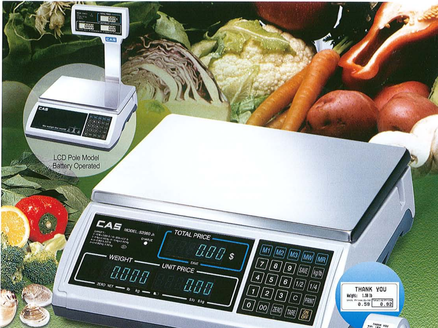
LCD Pole Model Battery Operated

Great For Candy / Coffee / Deli / Seafood Bakeries / Farmer's Market Up to 60 lb Capacity